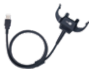
USB snap-on Cable